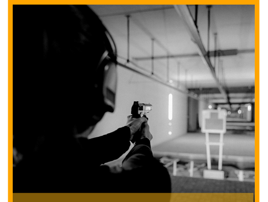
Handgun training for teachers